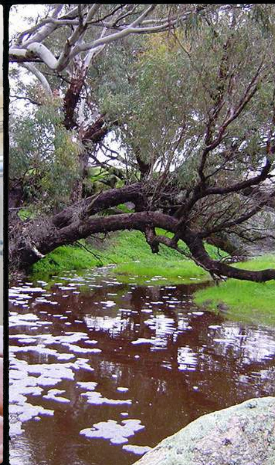
Hillside Country Retreat, York, WA