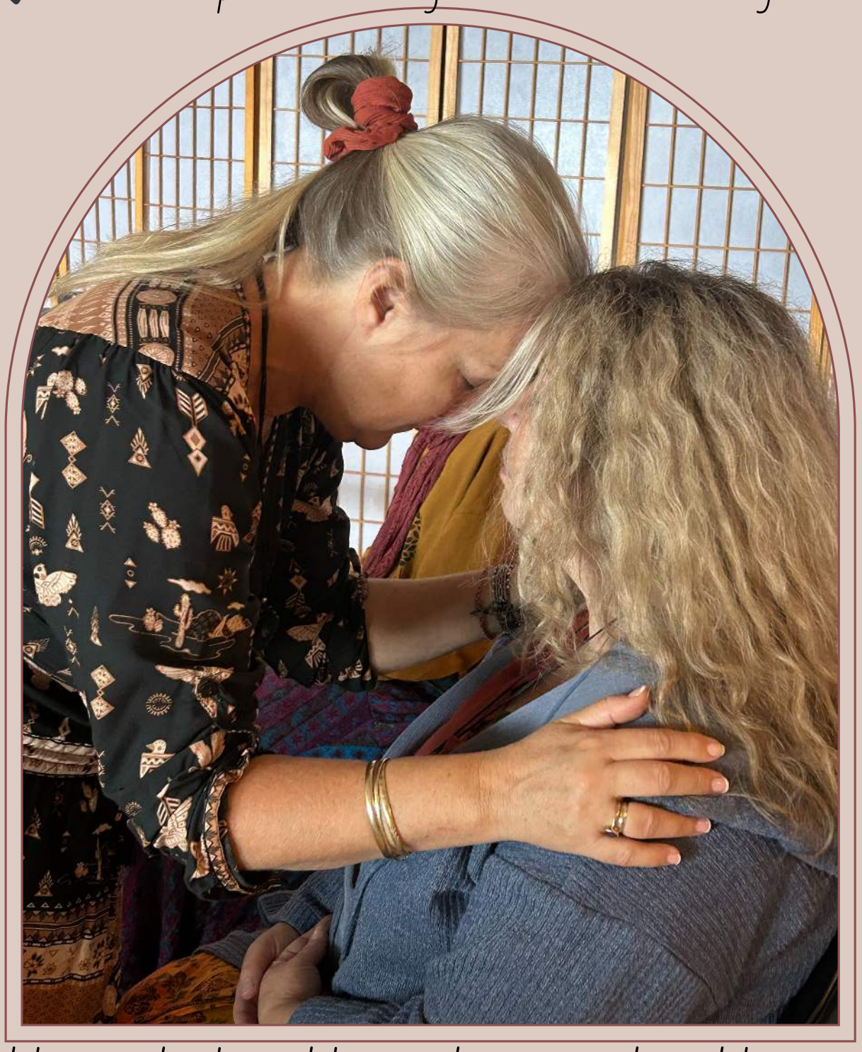
then take the step onto the shamanic path....

✓ An authentic process to allow your soul to evolve naturally?